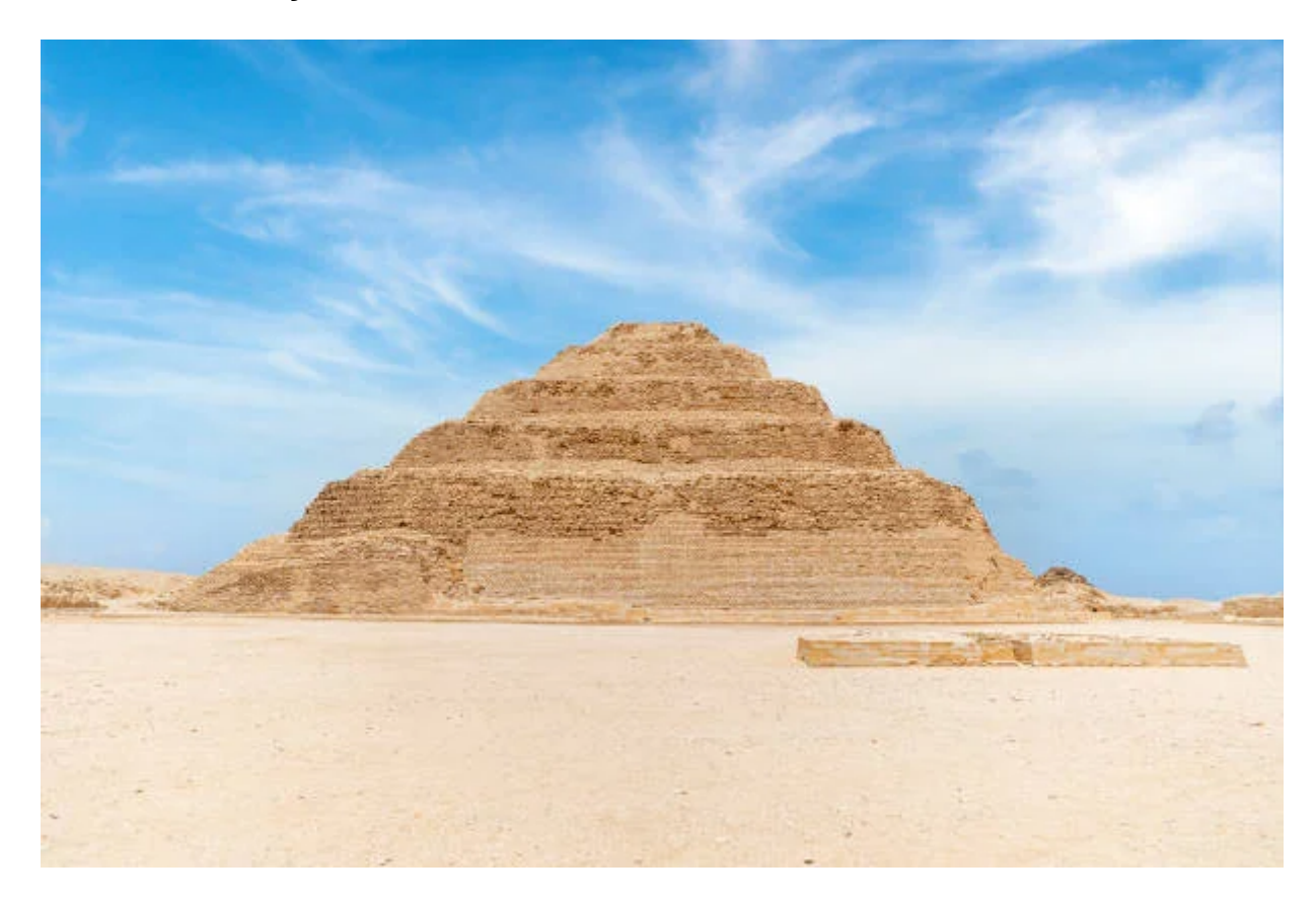
Giorno 2: Memphis, Sakkara, and Pyramids Tour