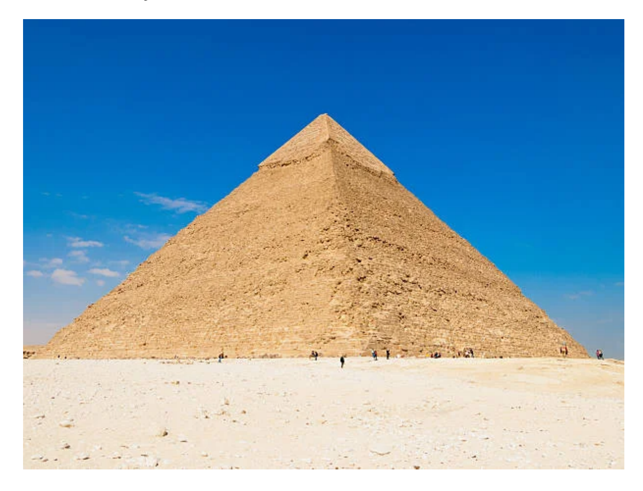
Giorno 2: Memphis, Sakkara, and Pyramids Tour

When you arrive at the airport, our representative will take you to your hotel in Cairo, where you will go to the three pyramids , then to Memphis , and then to the area of Saqqara footprints. The next day, you will go to the Egyptian Museum as well as the Museum of Civilization , and then our representative will take you to the Coptic Civilization , including the Jewish Temple, the suspended church, the Coptic Museum, and the famous Mary Greggis Church . On the evening, you will return to the hotel, and the next day you will go to the shortest and visit the Temple of the Shortest, and then the Karnak Temple, the Kings Valley, and the Hatchepsut Temple, as well as the