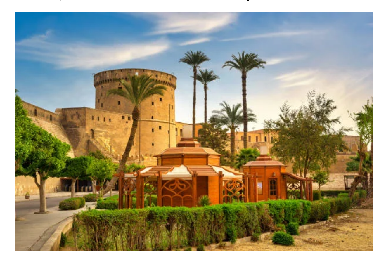
Giorno 5: Salah El-Din Citadel, Al-Sultan Hassan & Ibn Tulun Mosques

Once you arrive at the airport, we will take you to our representative by air-conditioned vehicle from the airport to your hotel in Cairo to rest after a tiring day of travel. You can spend the night quietly at our hotel in the morning of the next day. After eating breakfast, you will go with a professional guide to the pyramids of Giza , the three pyramids of Sakkara , and Memphis . After enjoying this tour, we will take you to a local restaurant for lunch and return to your hotel. The next day, we will take you to Alexandria to visit the Citadel of Qaitbay , where the king was in the late state of the Mamluks to protect them. To the pile of potsherds, which is one of the cemeteries in Alexandria, and in the evening, return to the hotel in Cairo to prepare to visit the Egyptian Museum , where there is a large collection of ancient relics, and then visit the National Museum of Civilization , which then takes you to the church and the Jews, where they learn about the nursery. Coptic Plus visits the Coptic Museum , and the next day reports to the Castle of Salah al-Din and then to the Khan El-Khalili Bazar where