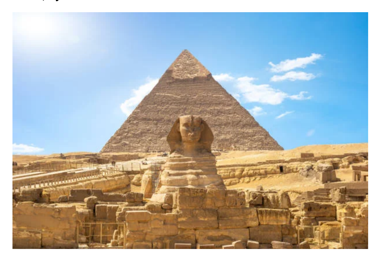
Jour 2: Memphis, Sakkara, Pyramids Tour

The journey of a long weekend Cairo starts at the first ever capital of ancient Egypt and the most important city in the world thousands of years ago, the ancient city of Memphis . The next stop is Saqqara , the burial ground for Egyptian kings and royals,