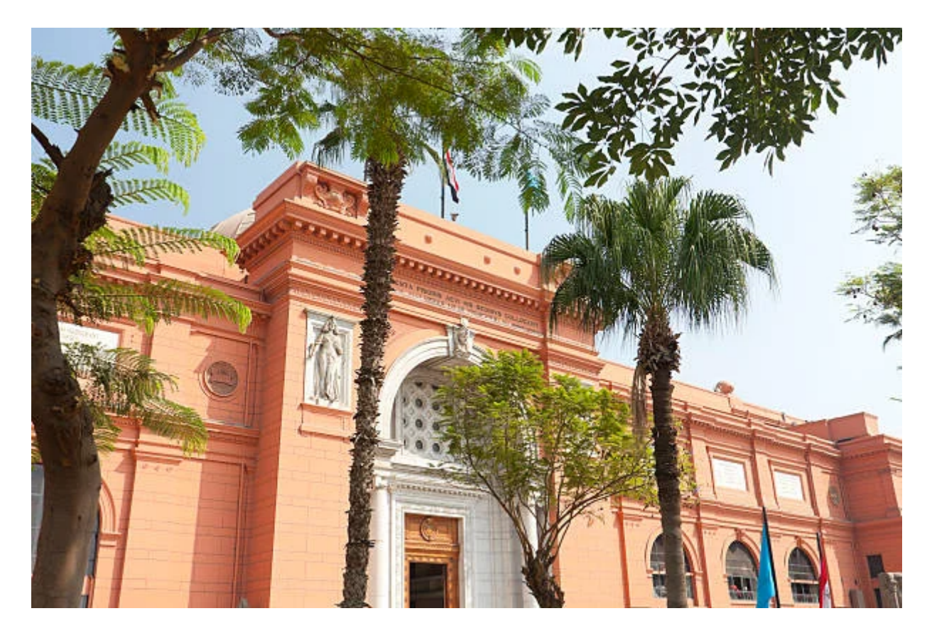
Jour 3: Egyptian Museum, National Museum of Civilization, old Cairo

The journey of a long weekend Cairo starts at the first ever capital of ancient Egypt and the most important city in the world thousands of years ago, the ancient city of Memphis . The next stop is Saqqara , the burial ground for Egyptian kings and royals,