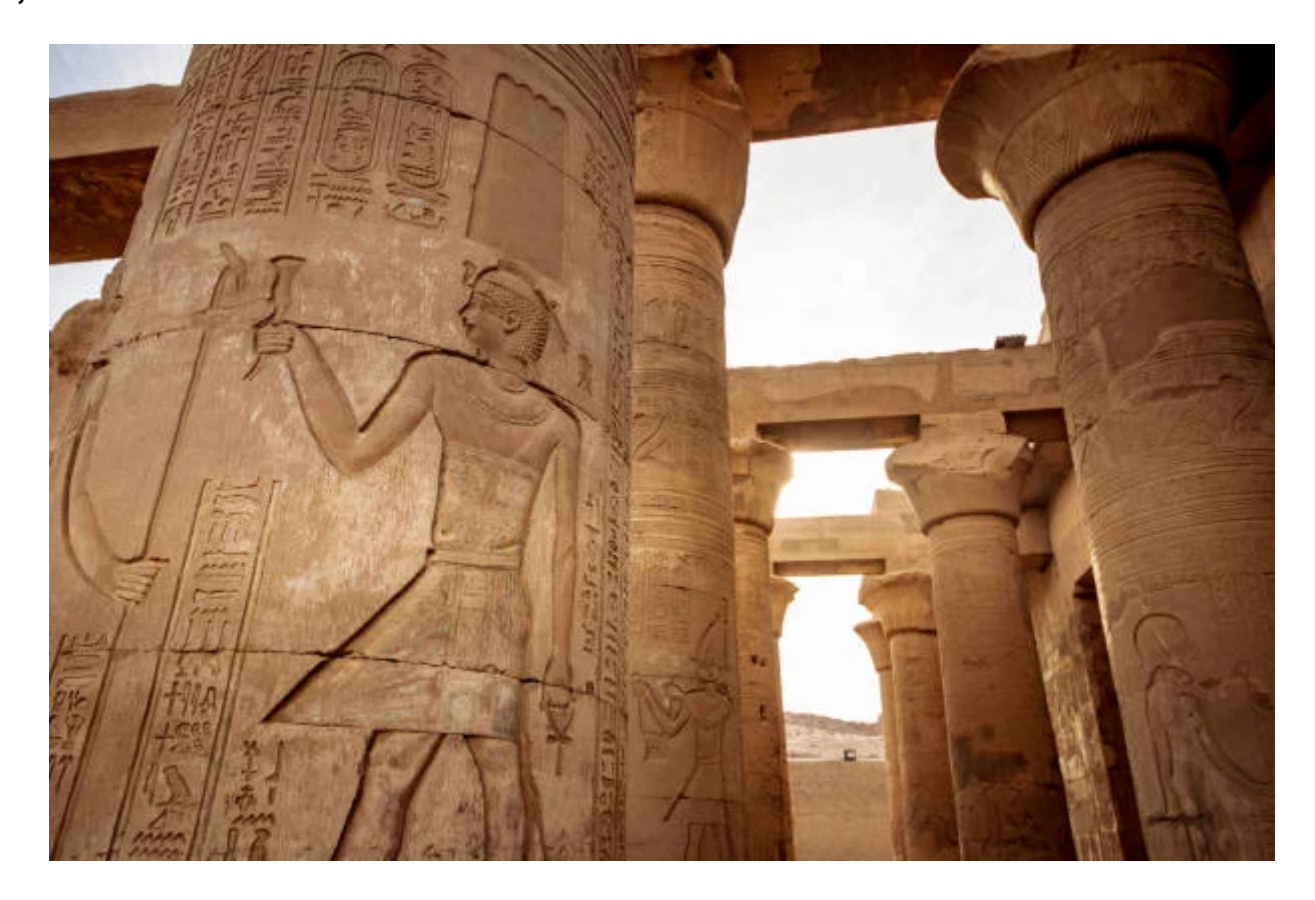
Jour 6: Kom Ombo, Edfu

The journey of a long weekend Cairo starts at the first ever capital of ancient Egypt and the most important city in the world thousands of years ago, the ancient city of Memphis . The next stop is Saqqara , the burial ground for Egyptian kings and royals,