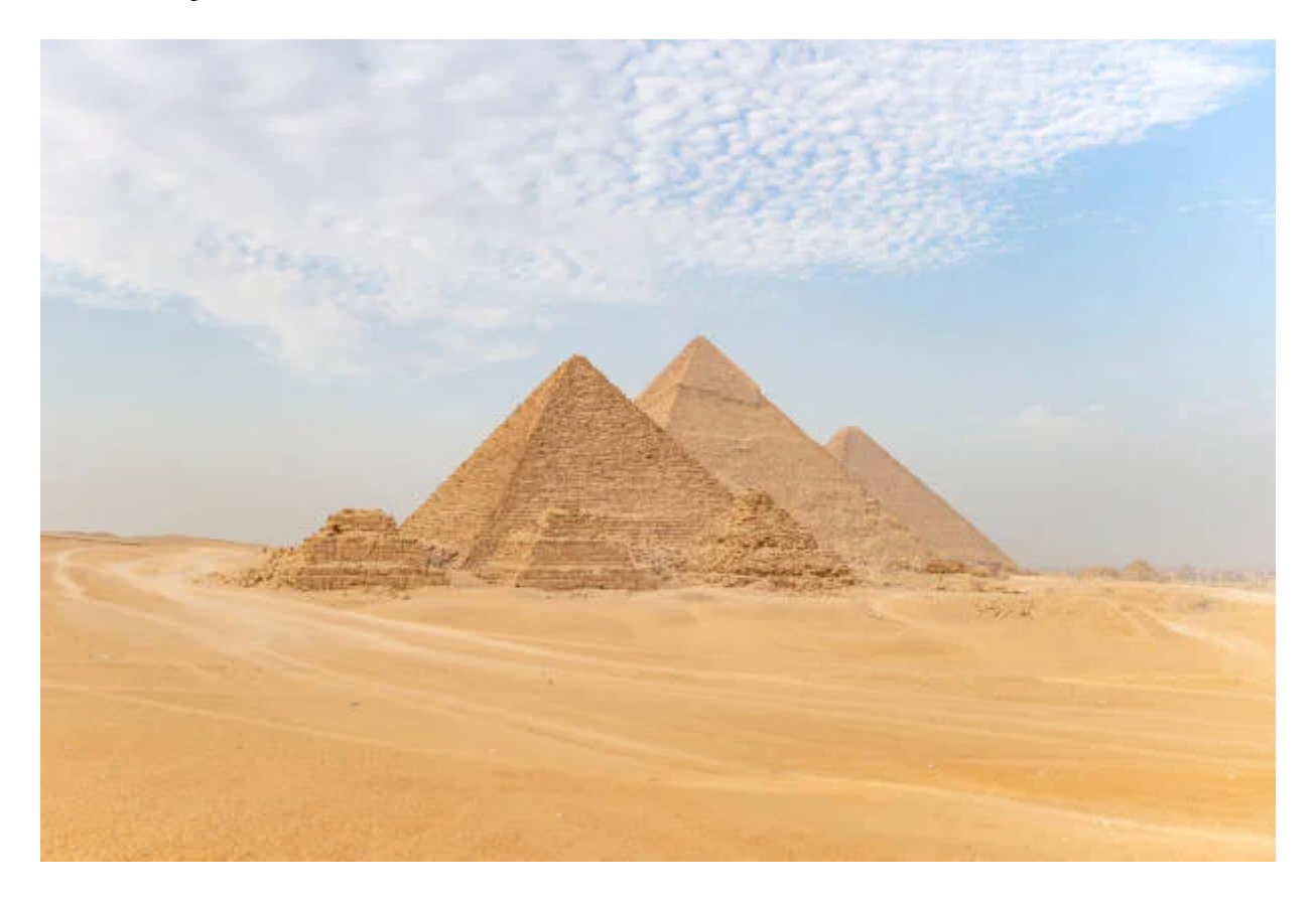
Jour 2: Memphis , Sakkara , Pyramids Tour