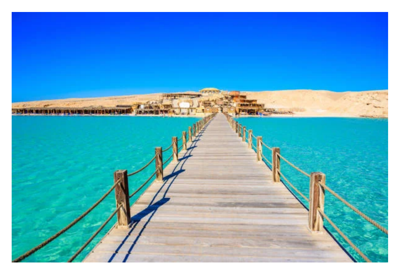
Jour 2: Fly to Hurghada