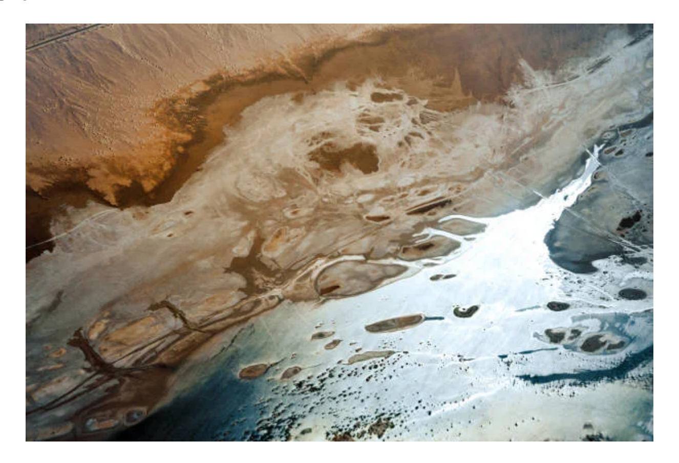
Jour 2: Shram El- Sheikh

Once you arrive at Cairo Airport, our representative will receive and welcome you, and then you will travel to Sharm El-Sheikh When you arrive at the airport, our representative will be waiting for you. He will take you in an air-conditioned car to go to your hotel to relax.