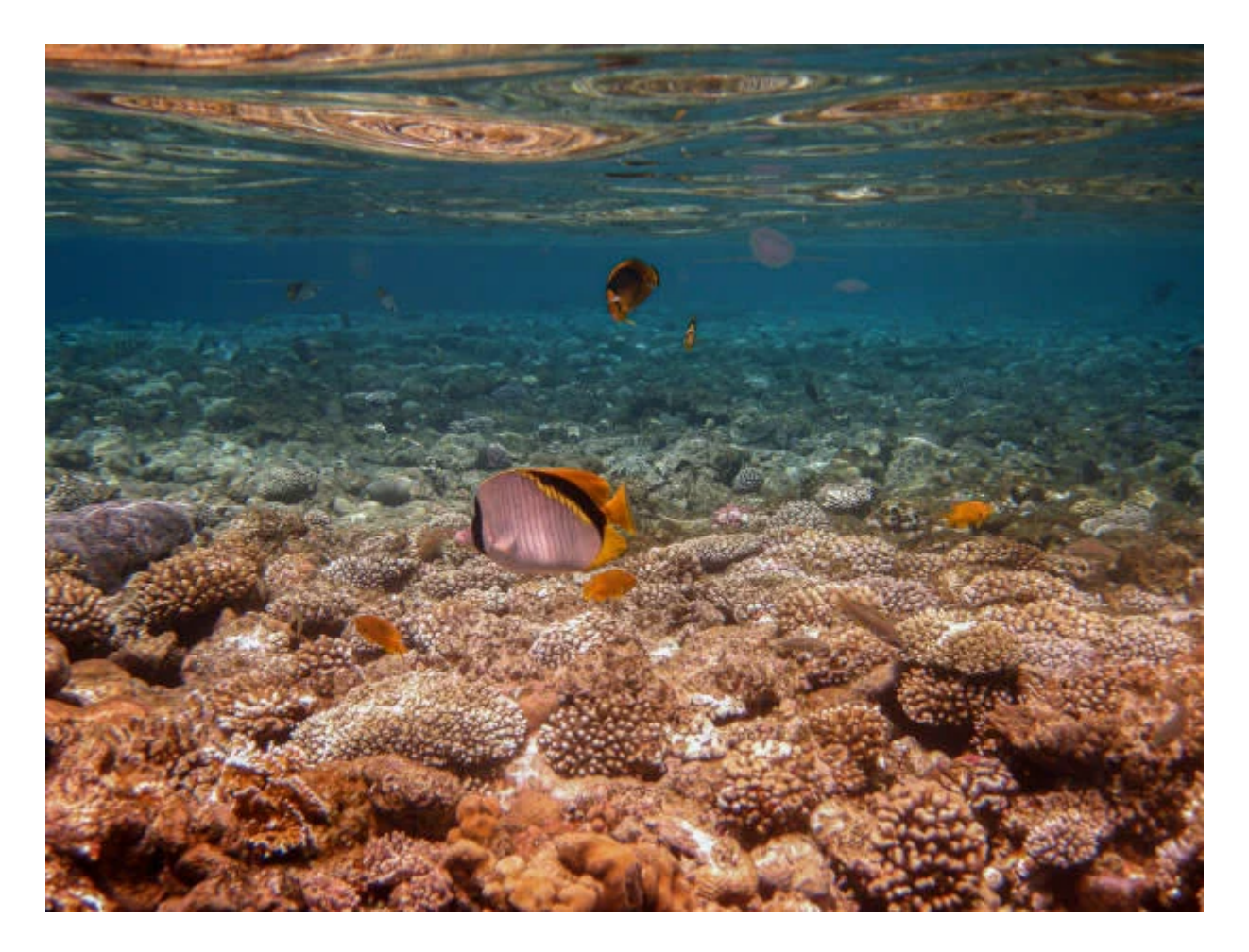
Jour 1: Arrival

Once you arrive at Cairo Airport, our representative will receive and welcome you, and then you will travel to Hurghada . When you arrive at the airport, our representative will be waiting for you. He will take you in an air-conditioned car to go to your hotel to relax.