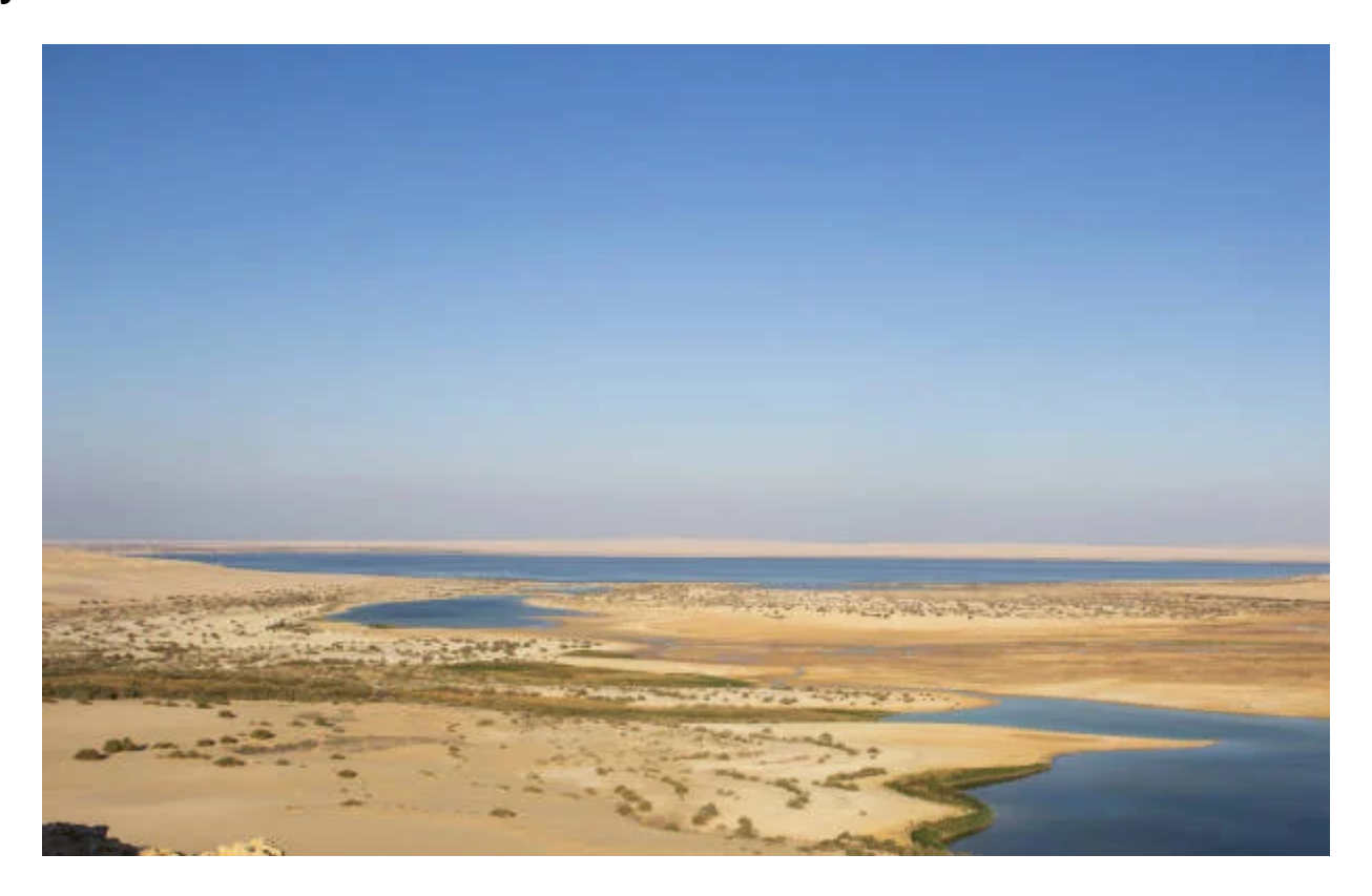
Jour 4: Overday Fayoum

the next day you will go to the Pyramids of Giza and then Saqqara and then Memphis and have lunch at a local restaurant the next day have breakfast at the hotel, our representative will take you to the National Museum of Civilization Which provides a historical overview from the Stone Age until now. and then to the Egyptian Museum It contains a large collection of ancient Egyptian antiquities. and then you will get acquainted with the Coptic civilization, where the Jewish Temple , The Hanging Church and Mary of Gergs ,