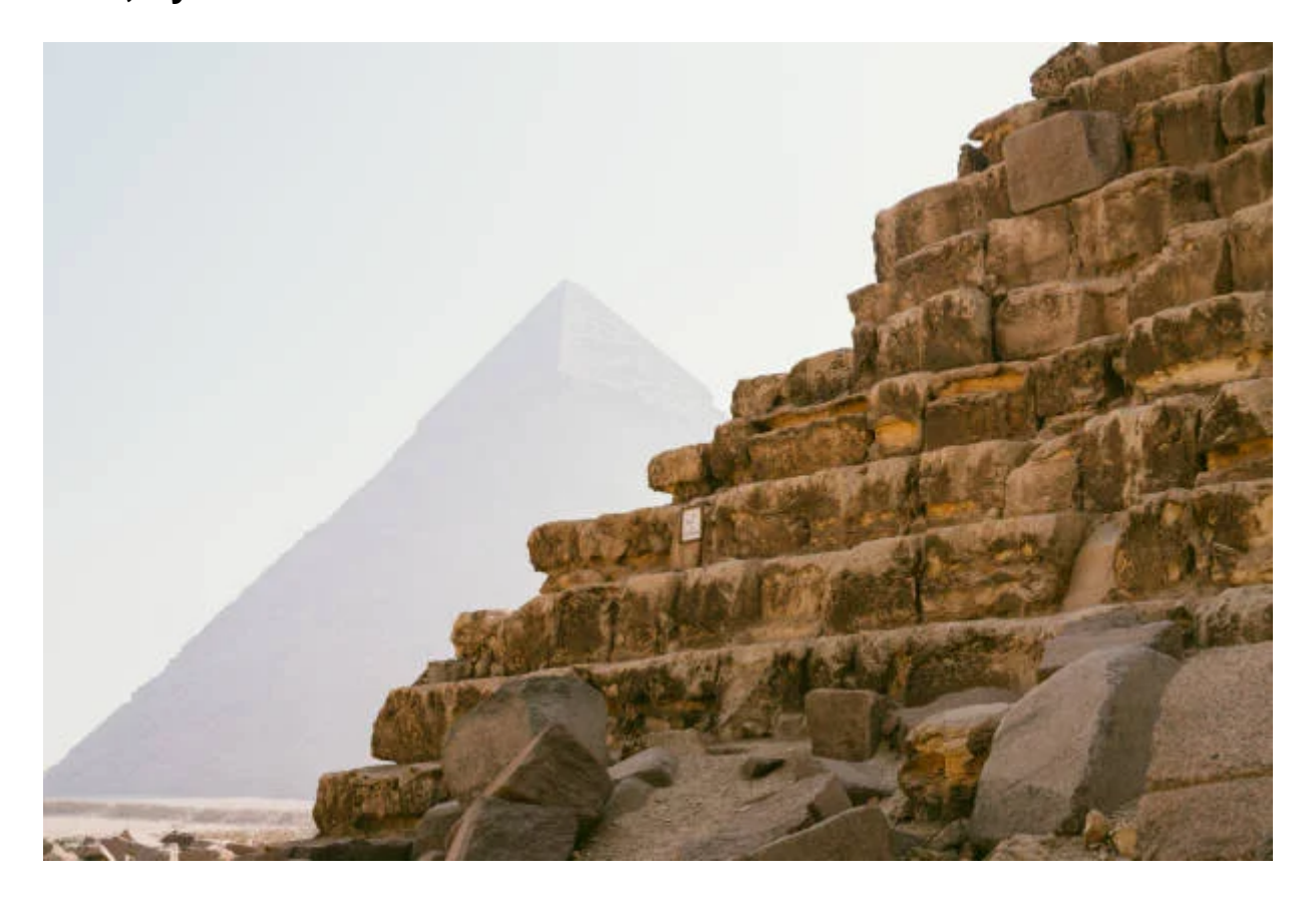
Jour 2: Memphis, Sakkara, Pyramids Tour

the next day you will go to the Pyramids of Giza and then Saqqara and then Memphis and have lunch at a local restaurant the next day have breakfast at the hotel, our representative will take you to the National Museum of Civilization Which provides a historical overview from the Stone Age until now. and then to the Egyptian Museum It contains a large collection of ancient Egyptian antiquities. and then you will get acquainted with the Coptic civilization, where the Jewish Temple , The Hanging Church and Mary of Gergs ,