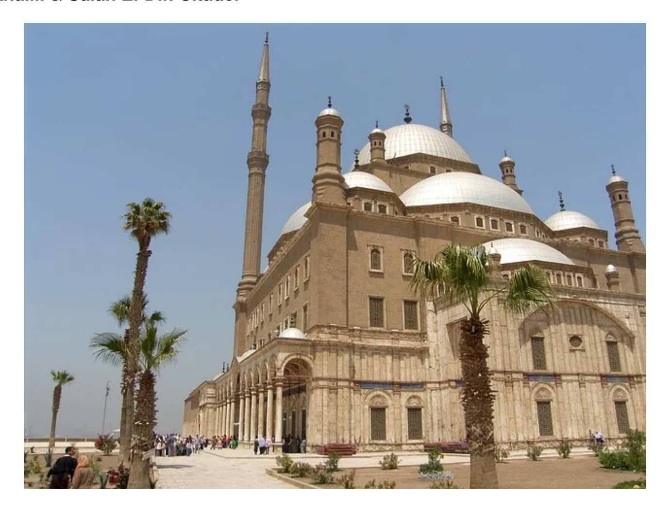
Jour 5: Khan el-Khalili & Salah El-Din Citadel

the next day you will go to the Pyramids of Giza and then Saqqara and then Memphis and have lunch at a local restaurant the next day have breakfast at the hotel, our representative will take you to the National Museum of Civilization Which provides a historical overview