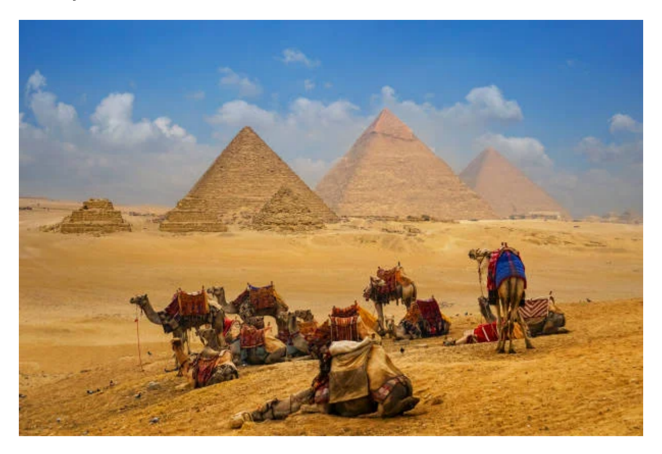
Día 2: Memphis, Sakkara, Pyramids Tour