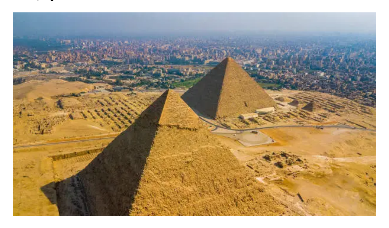
Día 2: Memphis, Sakkara, Pyramids Tour