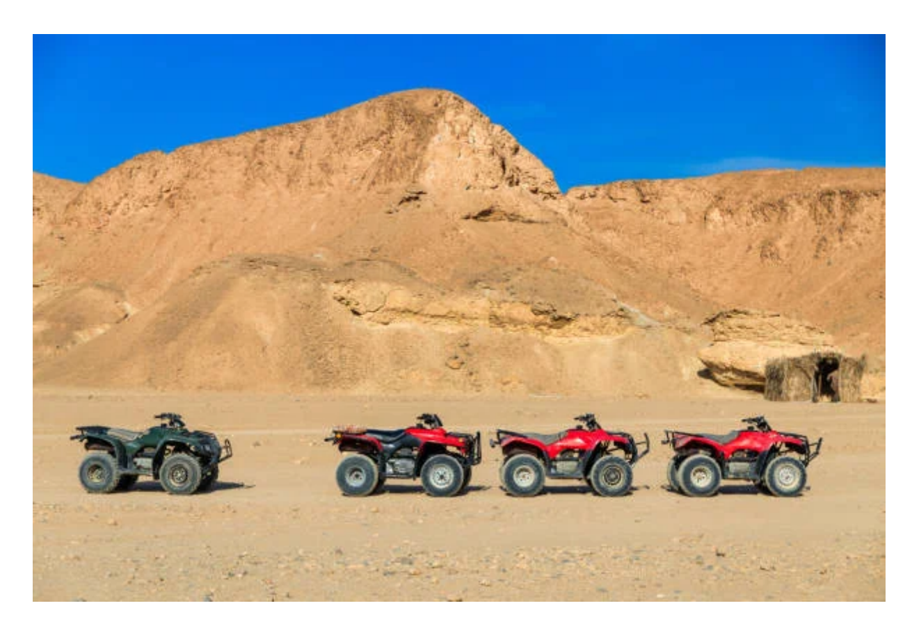
Día 3: Safari Tour

Once our representative receives you from the Marsa Alam airport and welcomes you, he will take you to a hotel so that you can have a pleasant time in your hotel and then eat lunch in addition to enjoying a quiet dinner. On the second day, you will go with our representative to practice many different activities and sports and enjoy the tranquility of the beach, clear waters, and rare fish. After that, you will eat dinner, and after spending three days, our representative will take you back to the airport.