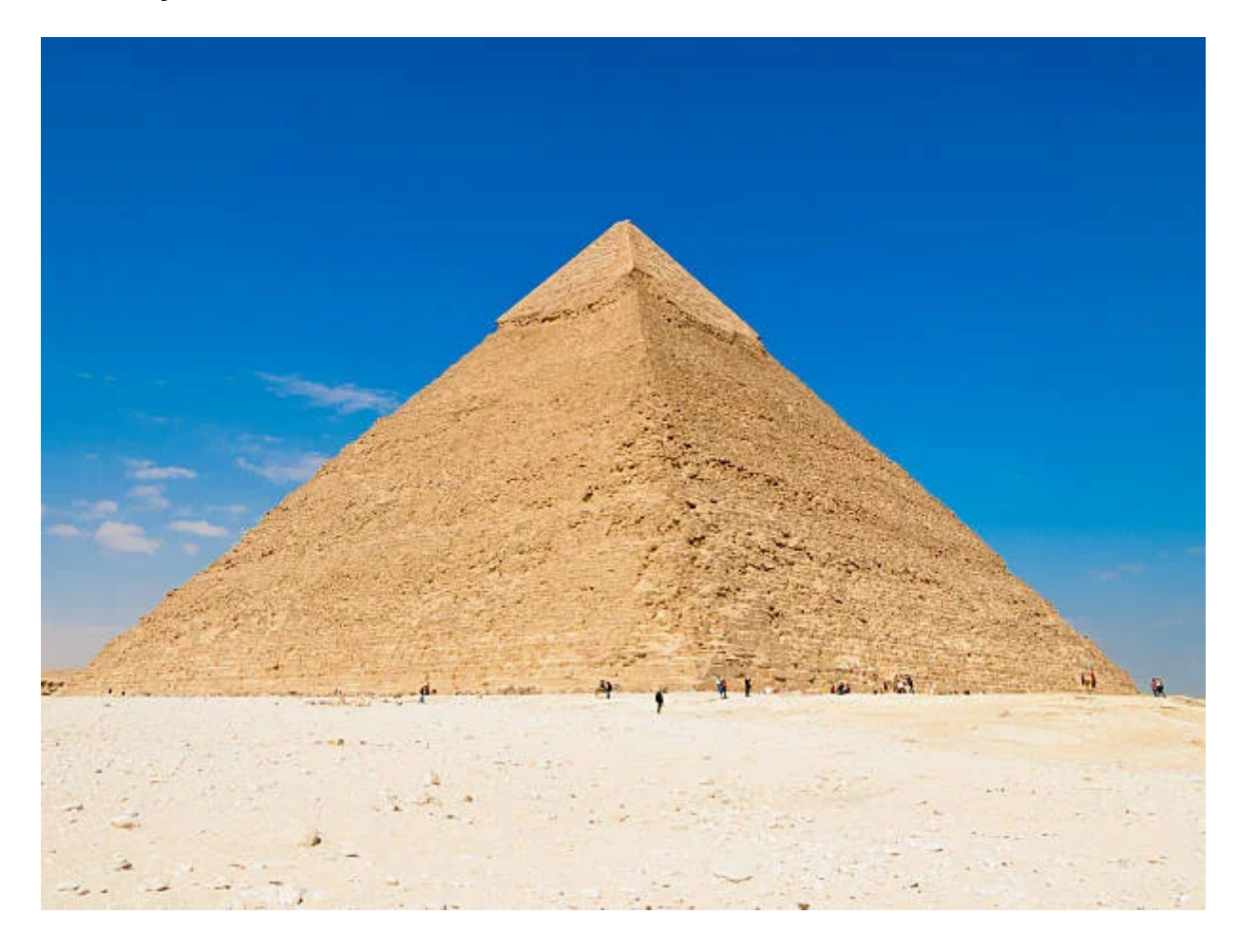
Día 2: Memphis, Sakkara, Pyramids Tour