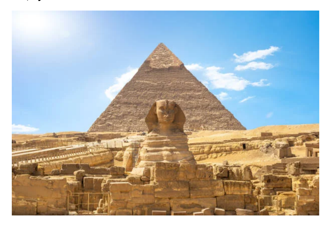
Día 2: Memphis, Sakkara, Pyramids Tour

Our trip gets under way in the capital of Egypt , visiting the most famous landmarks and monuments of Cairo, including the Great Pyramids of Giza, the Egyptian Museum , and National Egyptian Civilization and the old Cairo . We then fly south to witness the legacy of King Ramses II at Abu Simbel.