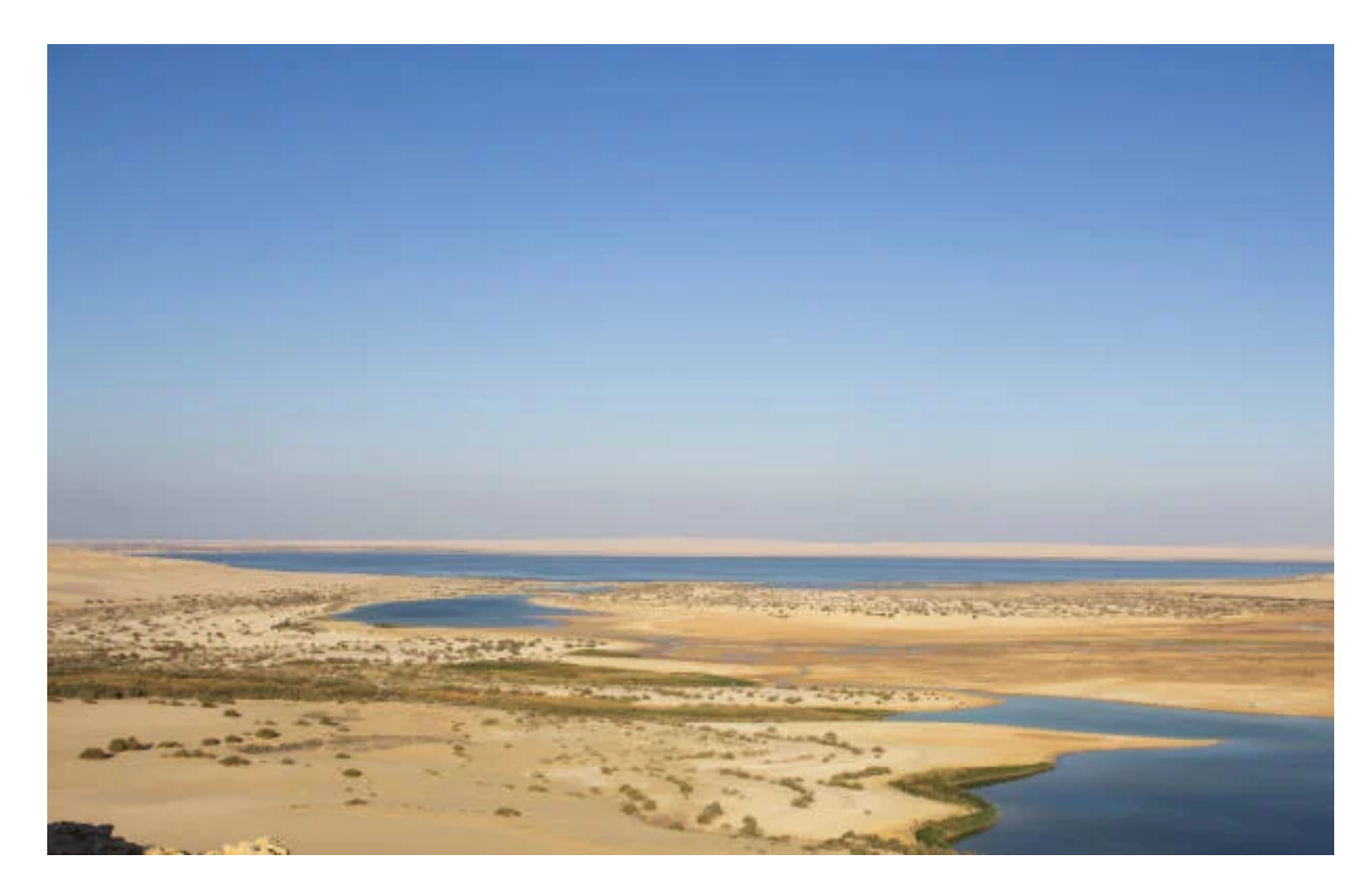
Día 4: Overday Fayoum

the next day you will go to the Pyramids of Giza and then Saqqara and then Memphis and have lunch at a local restaurant the next day have breakfast at the hotel, our representative will take you to the National Museum of Civilization Which provides a historical overview from the Stone Age until now. and then to the Egyptian Museum It contains a large collection of ancient Egyptian antiquities. and then you will get acquainted with the Coptic civilization, where the Jewish Temple , The Hanging Church and Mary of Gergs ,