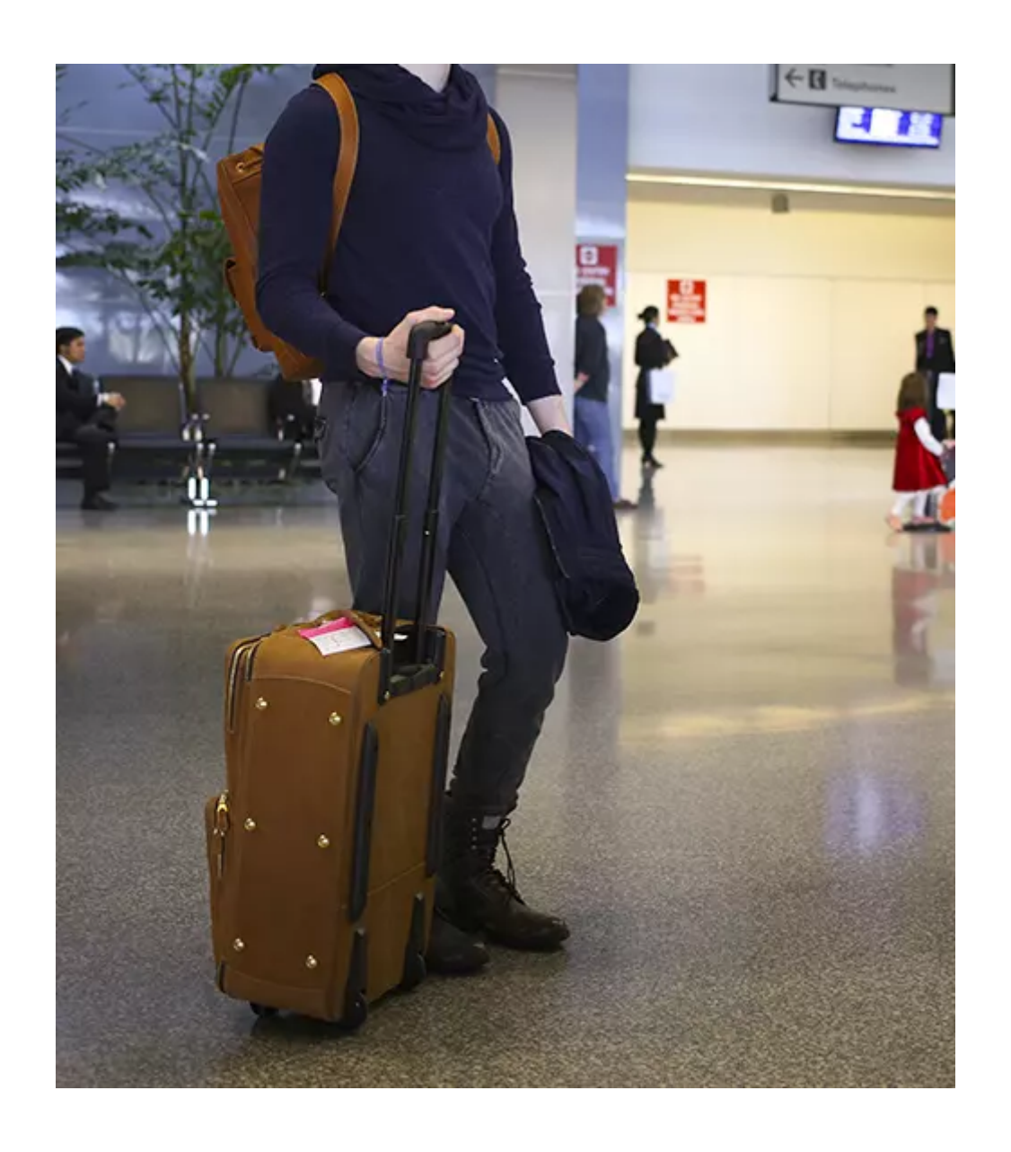
Día 6: Departure