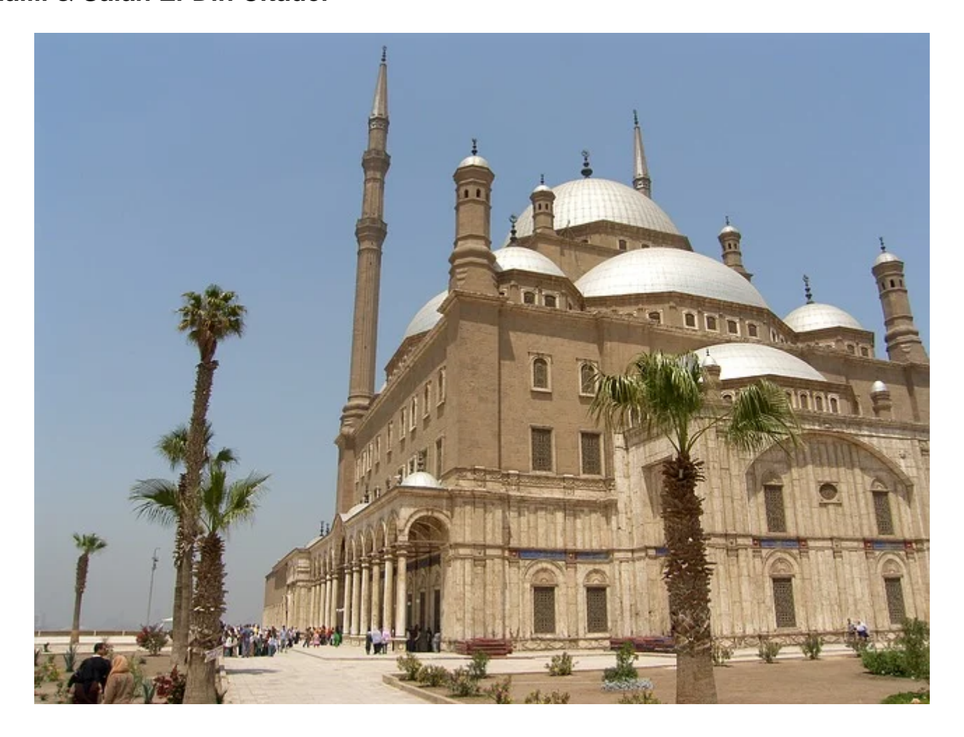
Día 5: Khan el-Khalili & Salah El-Din Citadel

the next day you will go to the Pyramids of Giza and then Saqqara and then Memphis and have lunch at a local restaurant the next day have breakfast at the hotel, our representative will take you to the National Museum of Civilization Which provides a historical overview