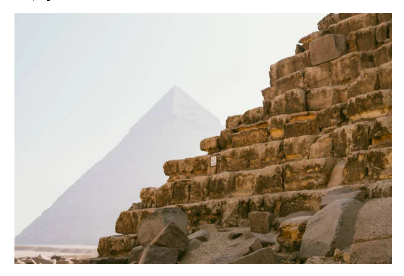
Día 2: Memphis, Sakkara, Pyramids Tour

the next day you will go to the Pyramids of Giza and then Saqqara and then Memphis and have lunch at a local restaurant the next day have breakfast at the hotel, our representative will take you to the National Museum of Civilization Which provides a historical overview from the Stone Age until now. and then to the Egyptian Museum It contains a large collection of ancient Egyptian antiquities. and then you will get acquainted with the Coptic civilization, where the Jewish Temple , The Hanging Church and Mary of Gergs ,