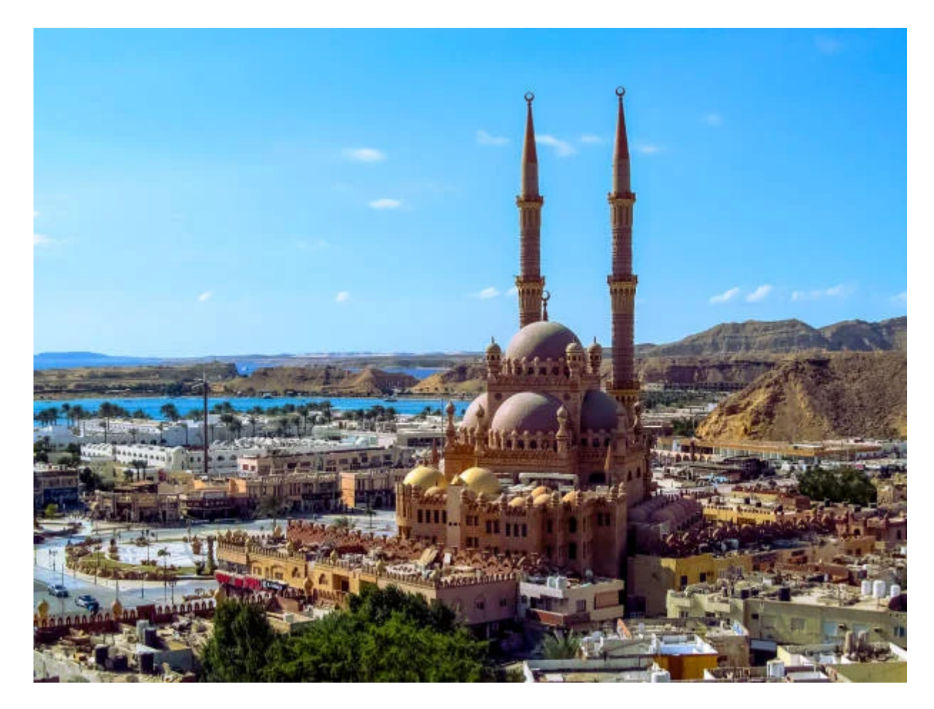
Tag 4: Fly to Sharm El-Sheikh

The journey of a long weekend Cairo starts at the first ever capital of ancient Egypt and the most important city in the world thousands of years ago, the ancient city of Memphis . The next stop is Saqqara , the burial ground for Egyptian kings and royals, will go to the Egyptian Museum and the Museum of Civilization , and after that you will You will learn about the Hanging Church and the Jewish Synagogue , you will go to you will go to Sharm El- Sheikh , In the evening you can walk around the city and get to know its markets and streets. You can also buy gifts for your friends. On the next day, you can practice many activities. You can also see rare fish. You can practice diving.