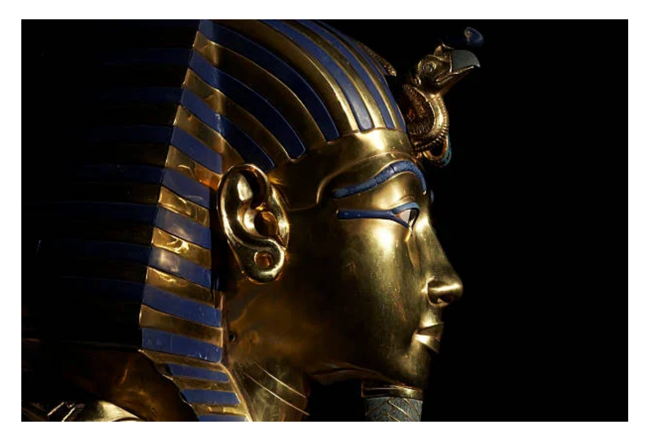
Tag 3: Egyptian Museum, Old Cairo

The journey of a long weekend Cairo starts at the first ever capital of ancient Egypt and the most important city in the world thousands of years ago, the ancient city of Memphis . The next stop is Saqqara , the burial ground for Egyptian kings and royals, will go to the Egyptian Museum and the Museum of Civilization , and after that you will You will learn about the Hanging Church and the Jewish Synagogue , you will go to you will go to Sharm El-Sheikh , In the evening you can walk around the city and get to know its markets and streets. You can also buy gifts for your friends. On the next day, you can practice many activities. You can also see rare fish. You can practice diving. And water skiing. The next day, you can spend time on a yacht all day ,When you return to Cairo, you will go to the Khan El Khalili .