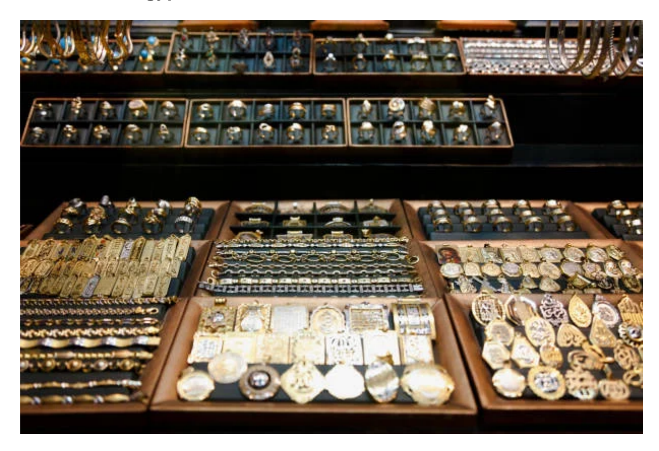
Tag 7: Fly back to Cairo, National Egyptian Civilization, Khan El Khalili

The journey of a long weekend Cairo starts at the first ever capital of ancient Egypt and the most important city in the world thousands of years ago, the ancient city of Memphis . The next stop is Saqqara , the burial ground for Egyptian kings and royals, will go to the Egyptian Museum and the Museum of Civilization , and after that you will You will learn about the Hanging Church and the Jewish Synagogue , you will go to you will go to Sharm El-Sheikh , In the evening you can walk around the city and get to know its markets and streets. You can also buy gifts for your friends. On the next day, you can practice many activities. You can also see rare fish. You can practice diving. And water skiing. The next day, you can spend time on a yacht all day, When you return to Cairo, you will go to the Khan El Khalili .