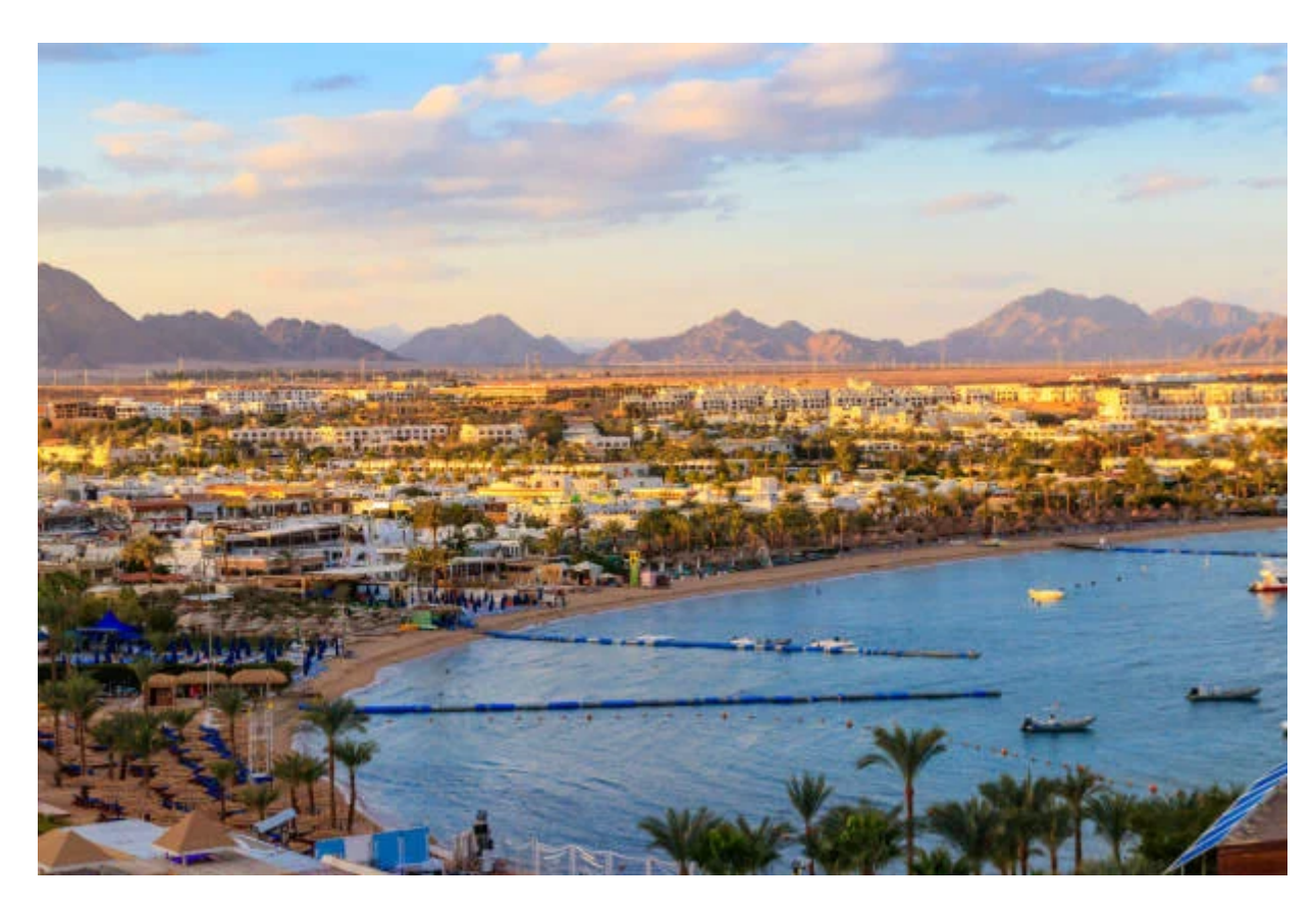
Tag 6: Sharm El-Sheikh

The journey of a long weekend Cairo starts at the first ever capital of ancient Egypt and the most important city in the world thousands of years ago, the ancient city of Memphis . The next stop is Saqqara , the burial ground for Egyptian kings and royals, will go to the Egyptian Museum and the Museum of Civilization , and after that you will You will learn about the Hanging Church and the Jewish Synagogue , you will go to you will go to Sharm El-Sheikh , In the evening you can walk around the city and get to know its markets and streets. You can also buy gifts for your friends. On the next day, you can practice many activities. You can also see rare fish. You can practice diving. And water skiing. The next day, you can spend time on a yacht all day, When you return to Cairo, you will go to the Khan El Khalili .