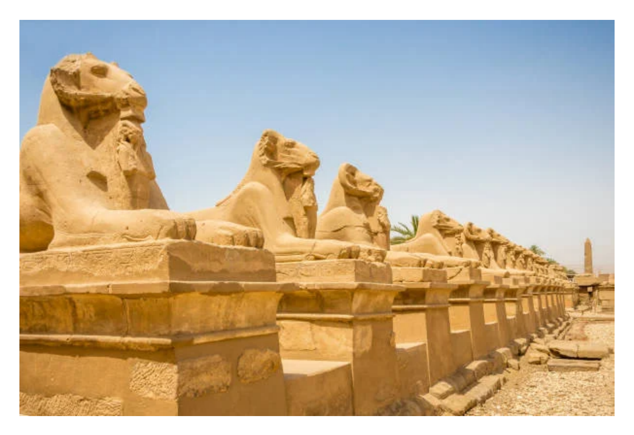
Tag 1: Check in, East Bank