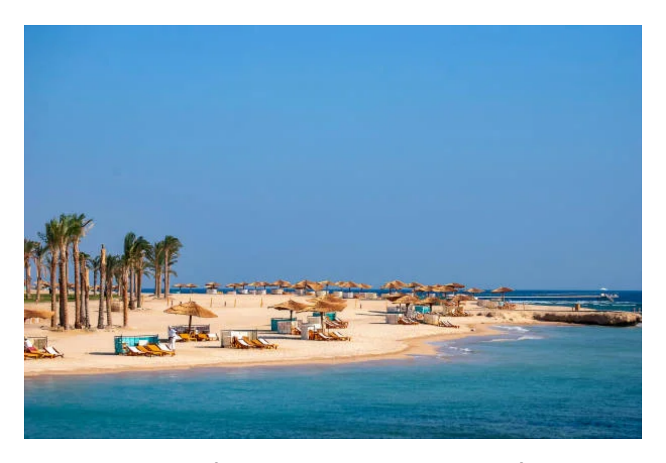
Tag 2: Marsa Alam

After our representative meets and greets you at the Cairo Airport, you will travel to Mars Alam. Our agent will be there to greet you when you get to the airport. He will drive you to your lodging so you can unwind in a stylish vehicle. There's much to do after lunch, including diving, snorkeling, surfing, and lounging on the beach. Savor the tranquility, beautiful weather, charming beach, and crystal-clear blue water. In addition, you can purchase presents for your loved ones and take a guided tour of the city's streets with one of our agents. The following day, our agent will transport you to the airport so you may catch a flight home after breakfast at your hotel.