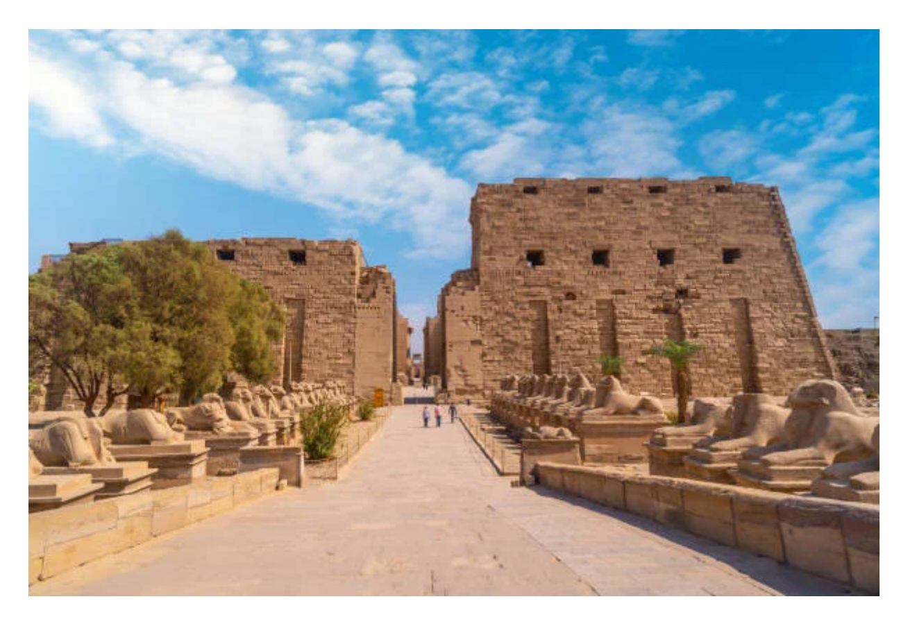
Tag 1: Check in , East Bank

When you arrive at the airport, our representative will visit the Luxor Temple after visiting the Karnak Temple . Beginning the next day, you and our representative will tour the Temple of Queen Hatshepsut and the Valley of the Kings ,