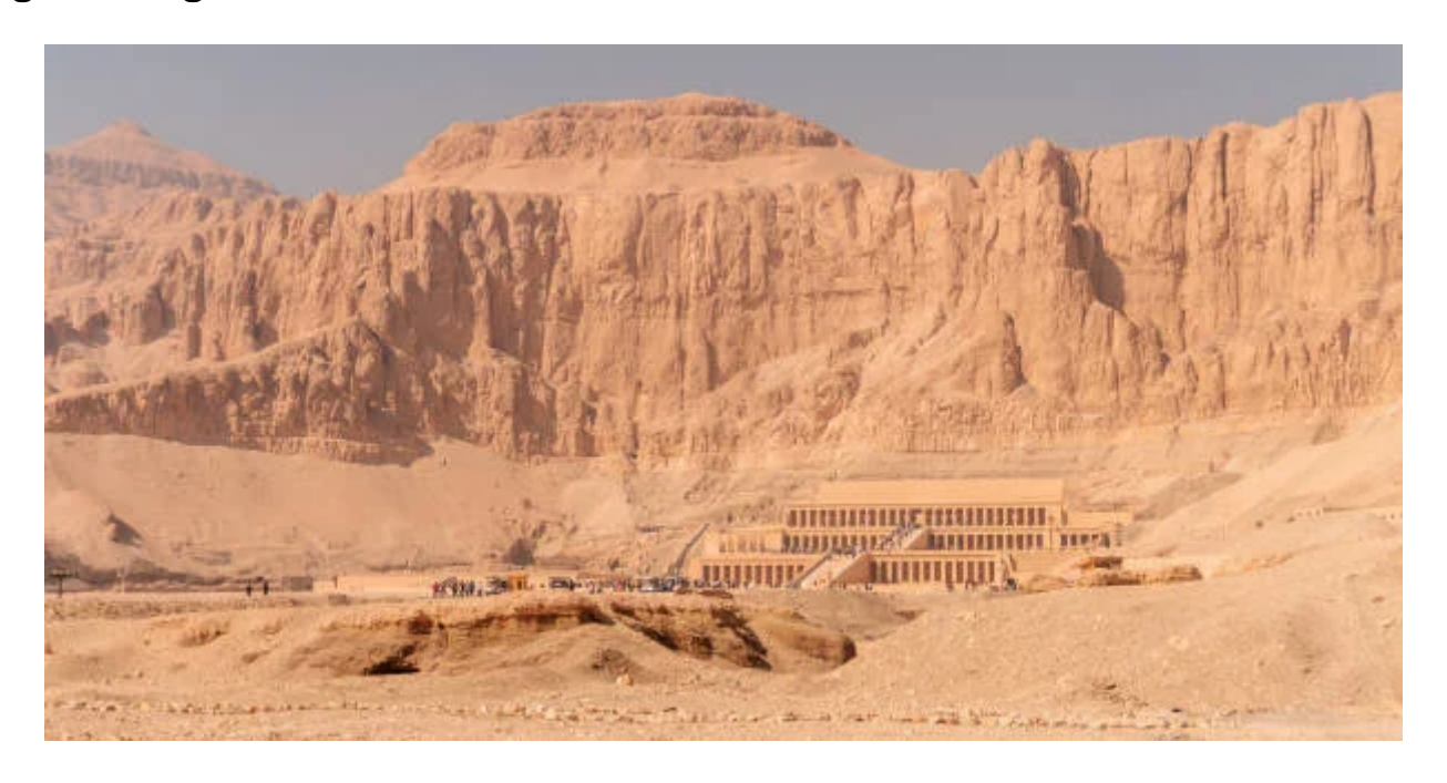
Tag 2: West bank sightseeing