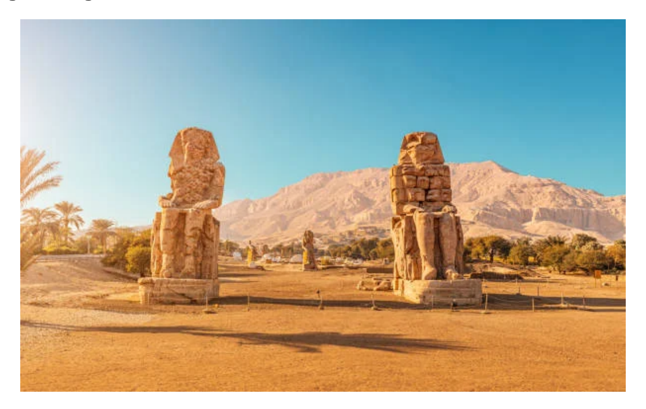
Tag 2: West bank Sightseeing