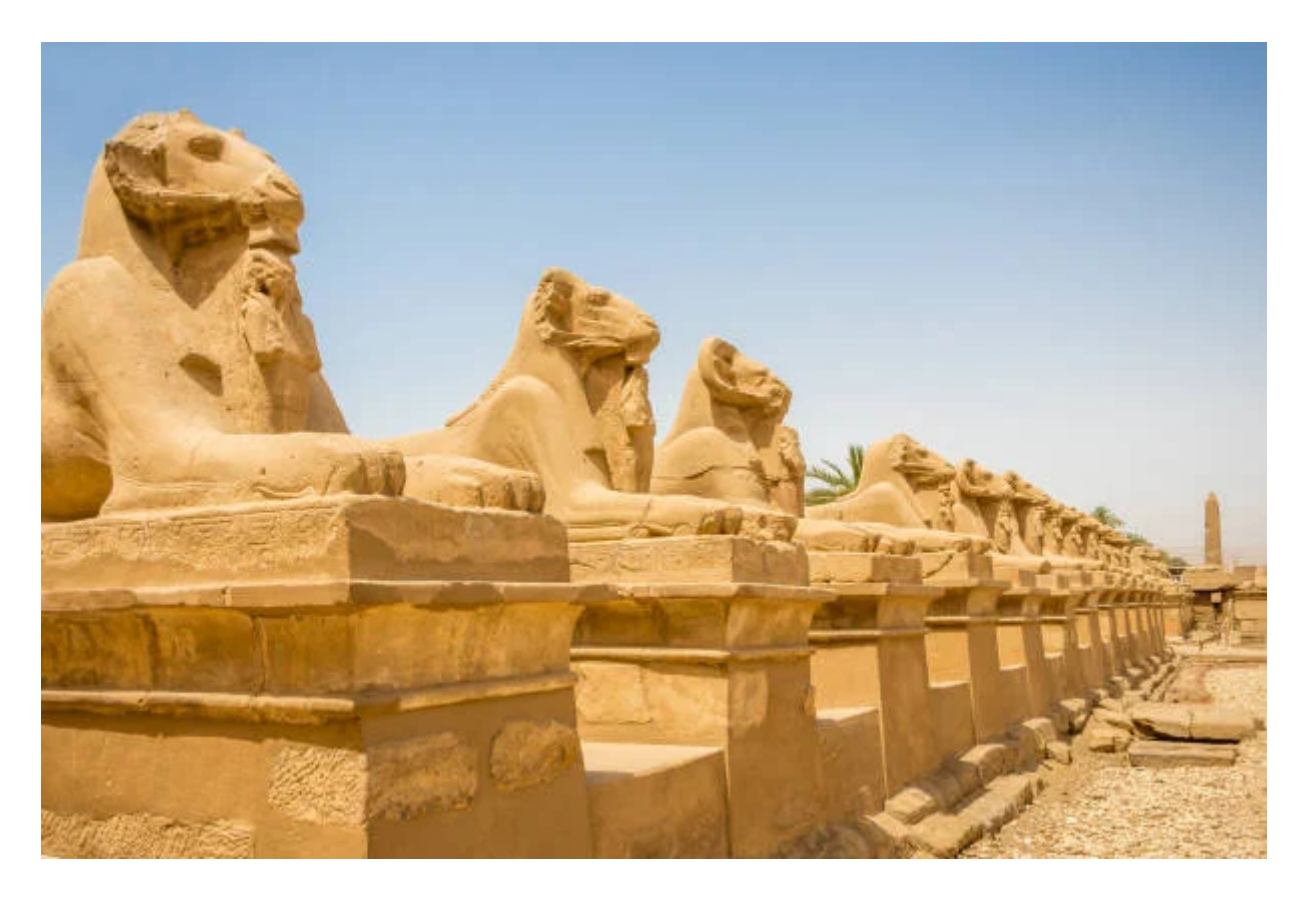
Tag 1: Check in , East Bank

When you arrive at the airport, our representative will visit the Luxor Temple after visiting the Karnak Temple . Beginning the next day, you and our representative will tour the Temple of Queen Hatshepsut and the Valley of the Kings ,