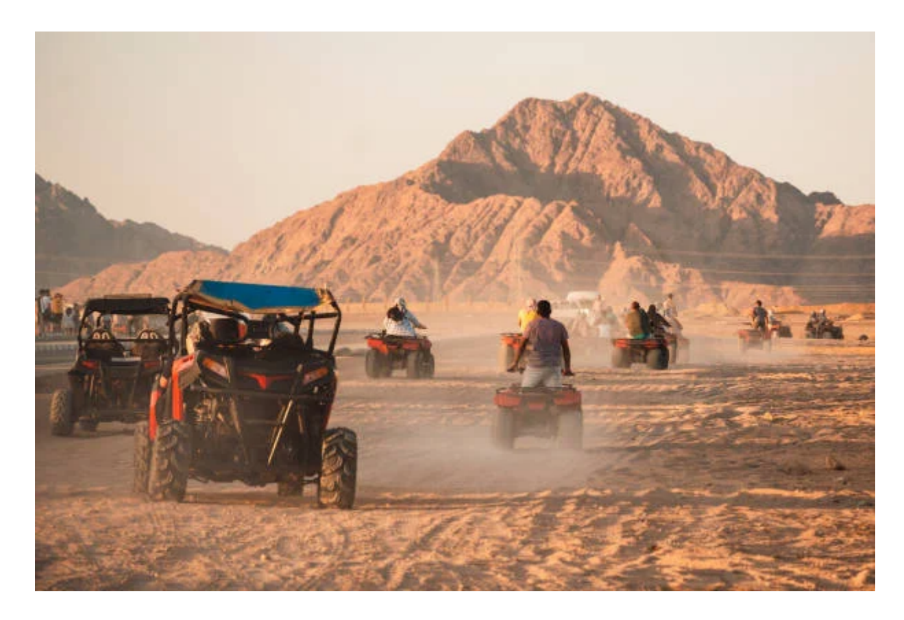
Tag 3: Safari Tour

Once you arrive at Cairo Airport, our representative will receive and welcome you, and then you will travel to Hurghada . When you arrive at the airport, our representative will be waiting for you. He will take you in an air-conditioned car to go to your hotel to relax.