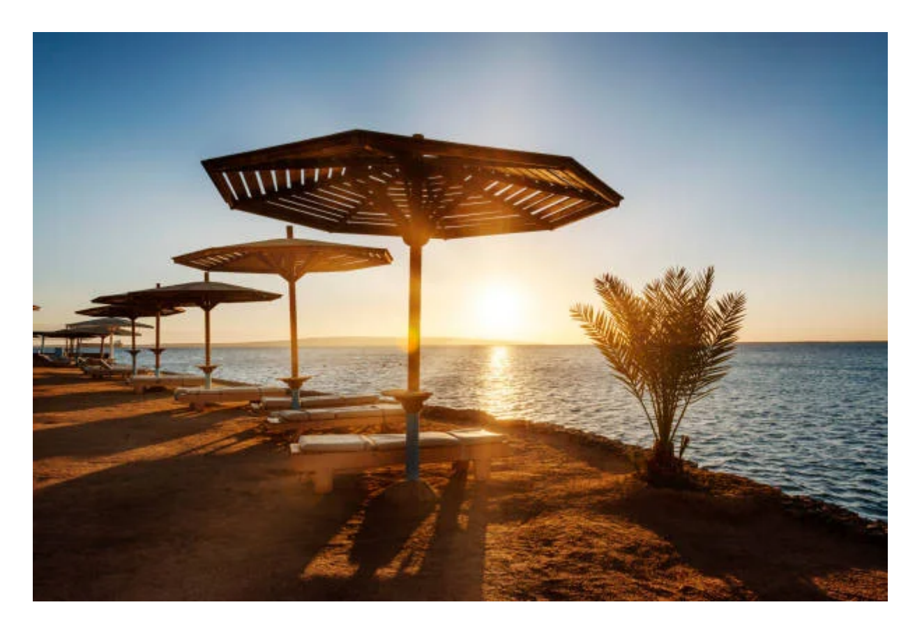
Tag 2: Hurghada

Once you arrive at Cairo Airport, our representative will receive and welcome you, and then you will travel to Hurghada . When you arrive at the airport, our representative will be waiting for you. He will take you in an air-conditioned car to go to your hotel to relax.