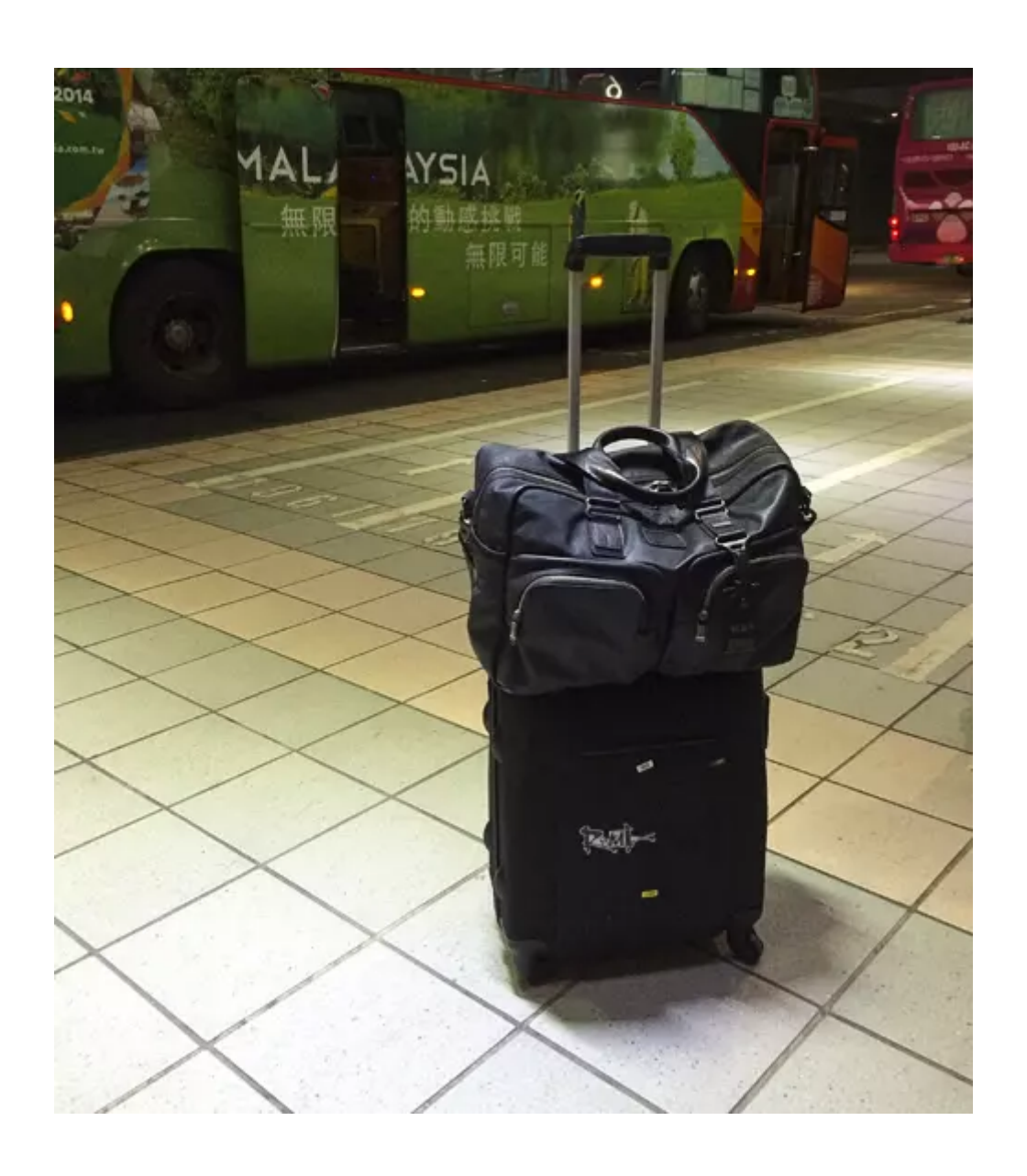
Tag 4: Departure