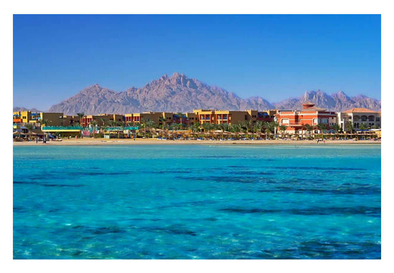
Tag 1: Arrival

Once you arrive at Cairo Airport, our representative will receive and welcome you, and then you will travel to Hurghada . When you arrive at the airport, our representative will be waiting for you. He will take you in an air-conditioned car to go to your hotel to relax.