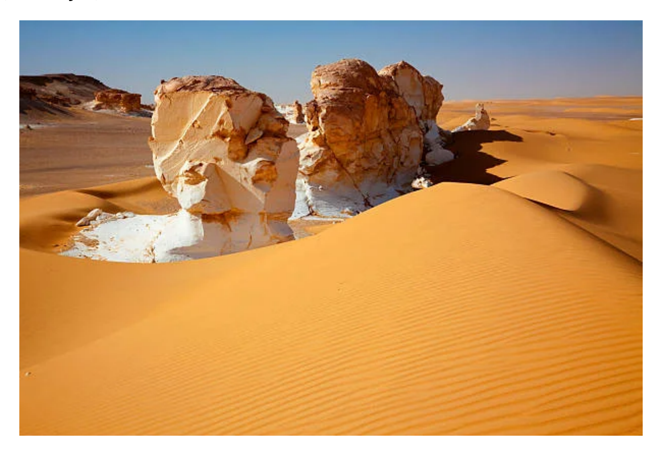
Tag 6: White Desert, Baharyia, Cairo

When you arrive at Cairo airport, you will meet our representative, Sera, who is air-conditioned, and go to your hotel and spend the night fun and quiet. The next day, you will go to the area of the pyramids of Giza and see the pyramids, the three, and the Sphinx , and then visit the pyramids of Saqqara , some after, and then we will take you to our representative for lunch, then return to your hotel to relax. The morning of the next day, after eating breakfast, we will take you to our delegates to visit the Egyptian Museum and Religions, the Hanging Church , and the Jewish Museum , Coptic, and then take a break to eat lunch on the fourth day of your trip. After breakfast, you will go on a four-hour trip into the white desert on After about 350 km, you will stop to have lunch and some refreshments, also known as the jewel of the desert, because it is a hill of crystal-like crystals where you can watch suitable exhilarating when the light hits it, then it will be used in horses in the desert and dinner in the camp, but enjoy watching the stars, and the next day you can enjoy a full day in health. White will use the location